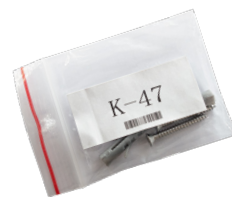
Wall mount set