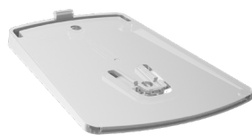
Base leg and pads