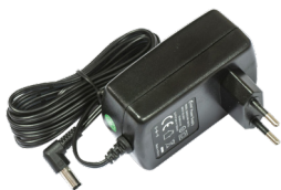
24 V 1.2 A power adapter